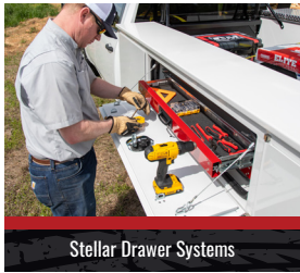
Stellar Drawer Systems