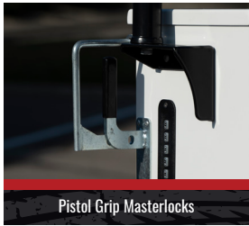
Pistol Grip Masterlocks