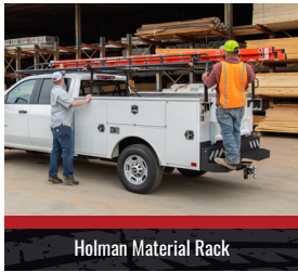
Holman Material Rack