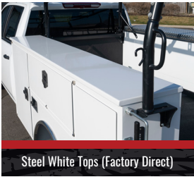
Steel White Tops (Factory Direct)

OPTIONAL FEATURES INCLUDE: Flip-Top Side Pack Compartments; Steel White Tops (Factory Direct); Pistol Grip Masterlocks; Material Rack; C-Tech or Stellar Drawers; Headache Rack