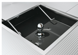
30K lb. B&W Gooseneck Turnover Ball

OPTIONAL FEATURES INCLUDE: 30K lb. B&W Gooseneck Hitch with Turnover Ball (Required for 5th Wheel Capability); CTech or Stellar Drawers in Front Utility Toolboxes