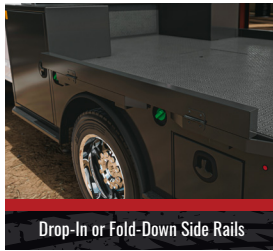
Drop-In or Fold-Down Side Rails