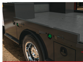
Drop-In or Fold-Down Side Rails